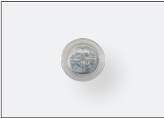
RENO-WP-PS Standalone Photocell Sensor (DC)