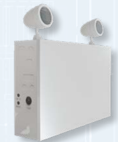
EMERGENCY BATTERIES & REMOTE HEADS

Combination Power/Running Man units offer the dual functionality of locating exit ways and illuminating the adjacent area in the event of a power loss. Our collection of Combo Units are available in Steel or Thermoplastic.